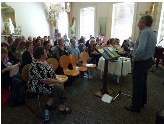
MDB Update in the ballroom at Como House

The 2011 Conference was very successful. There were 80 participants, many of whom were about to teach VCE Geography in 2012 for the first time. The conference resources were distributed on a USB flash drive. The popularity of the conference in 2011 indicates that it is important for you to register for professional learning opportunities well in advance.