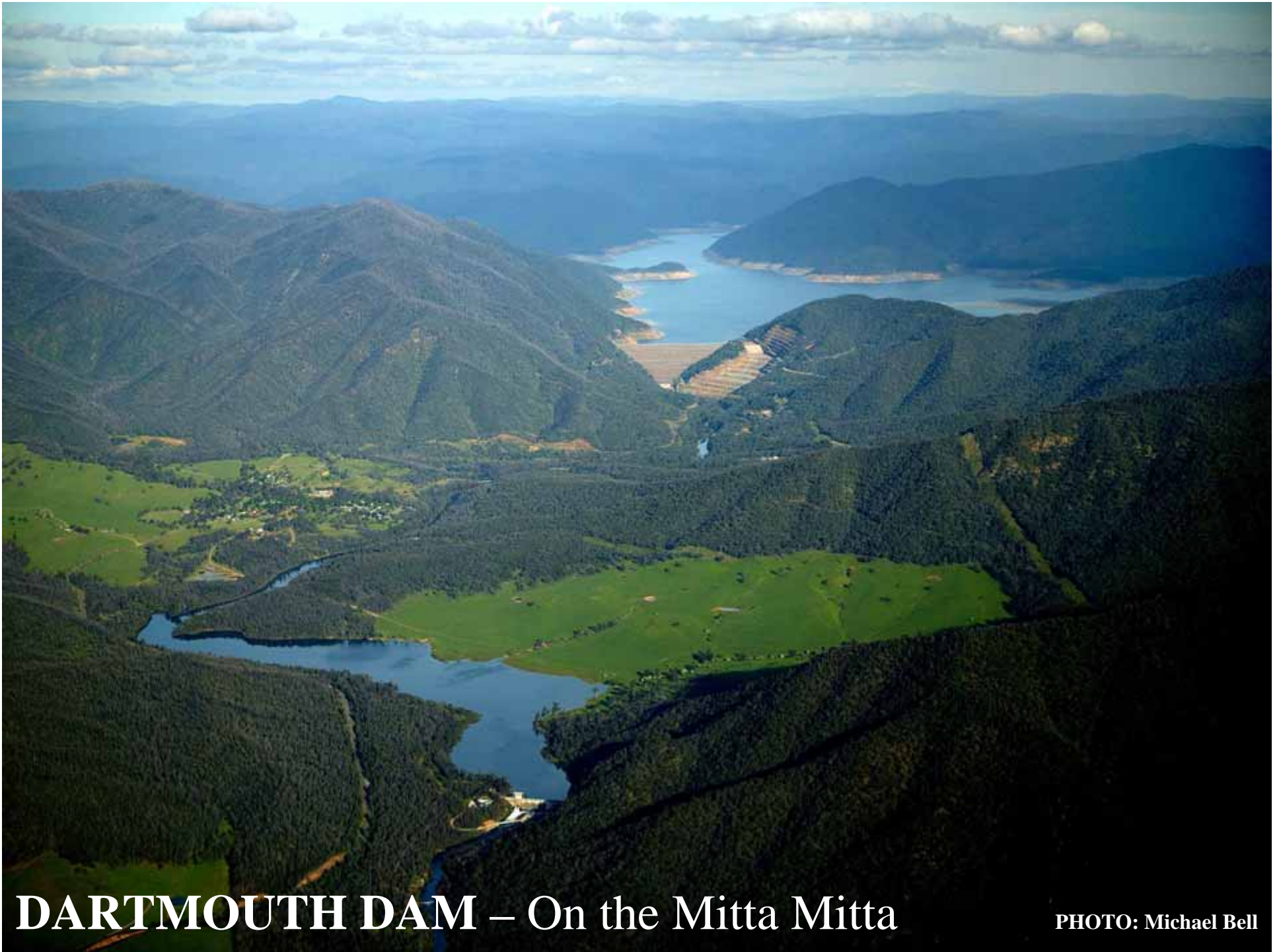
DARTMOUTH DAM – On the Mitta Mitta