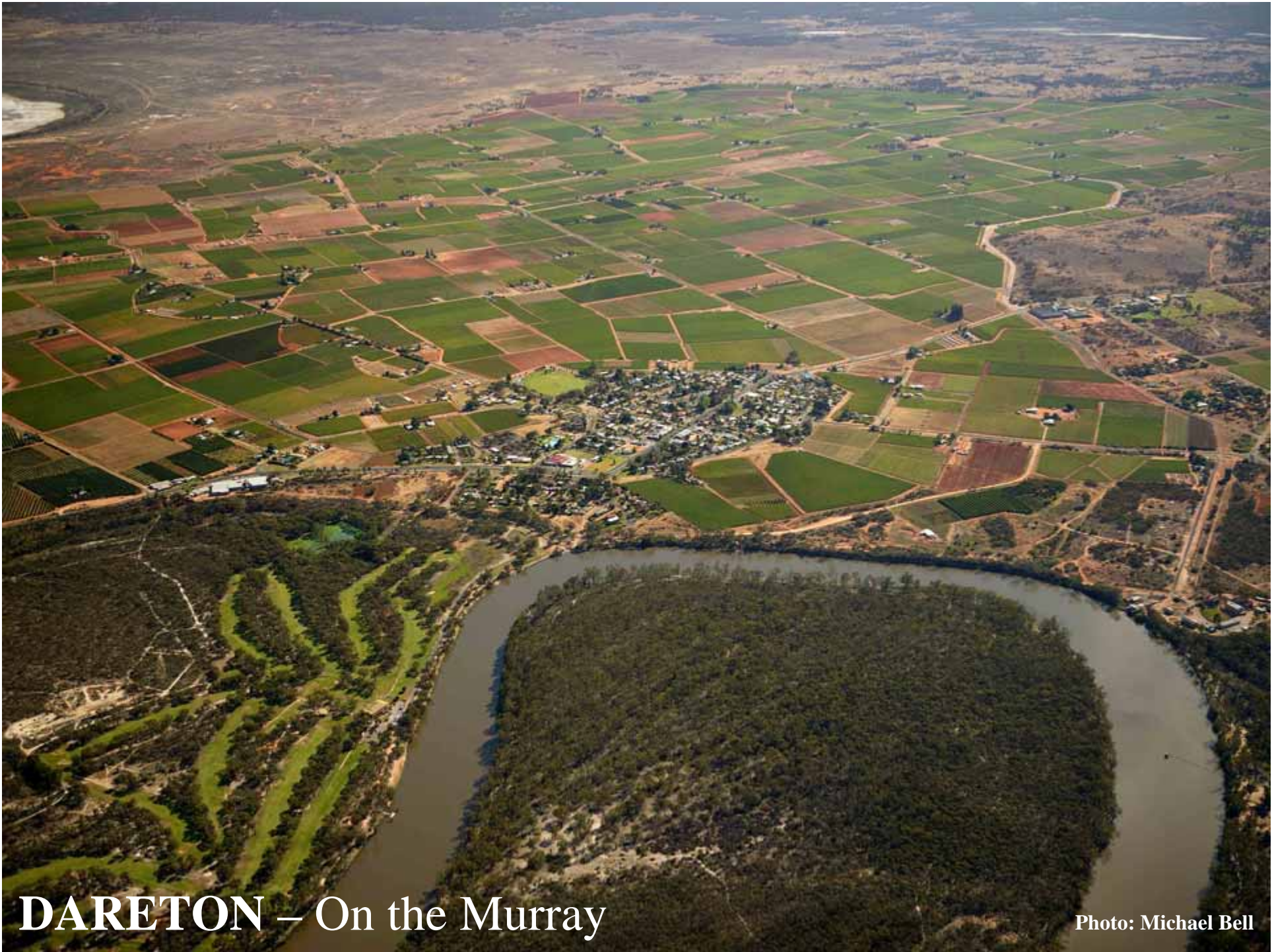
DARETON – On the Murray