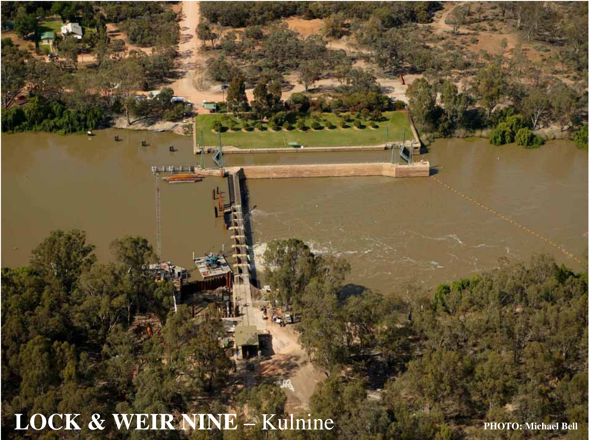
LOCK & WEIR NINE – Kulnine