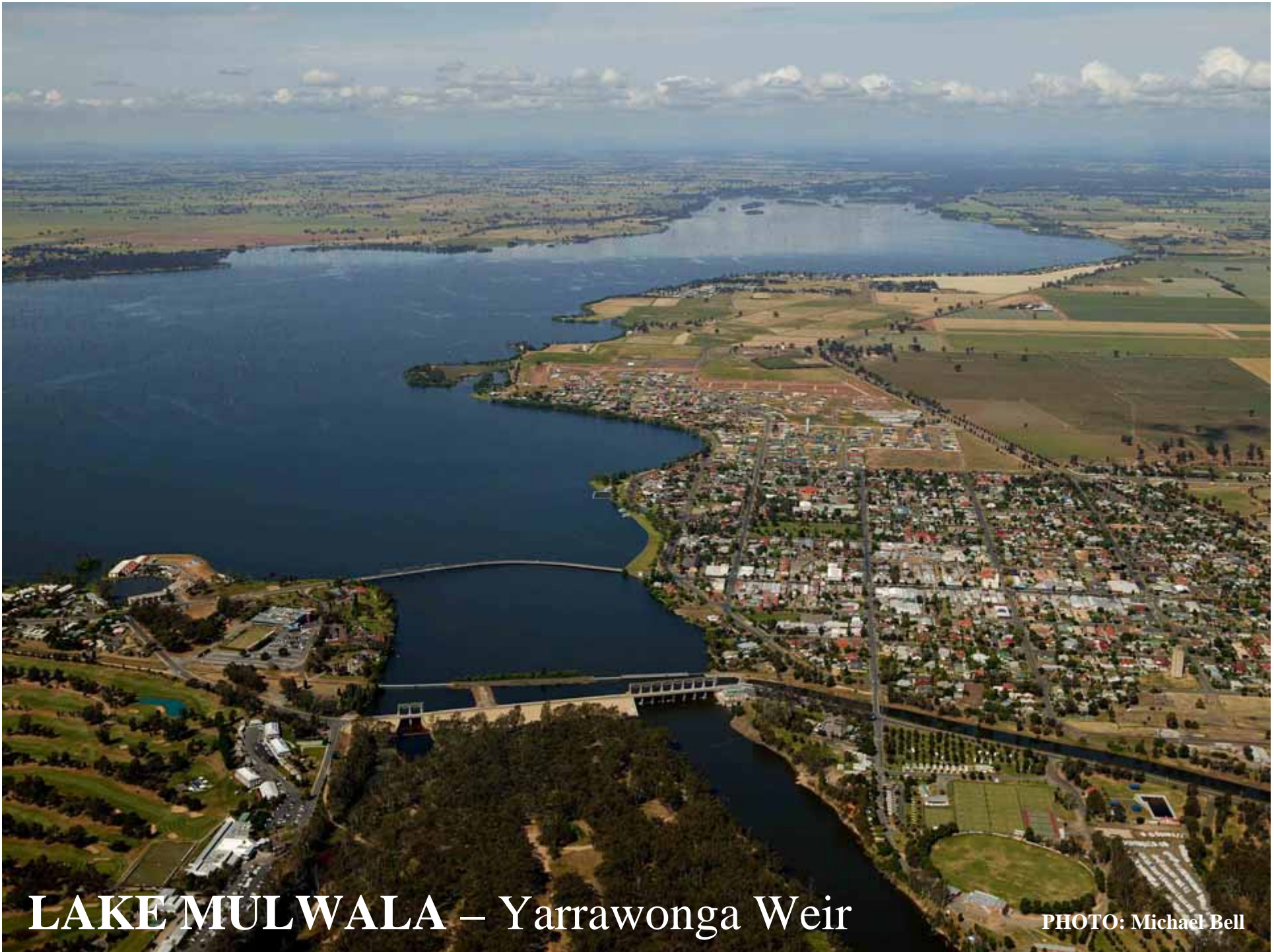
LAKE MULWALA – Yarrowonga Weir